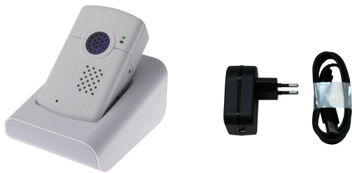
Mobile Lite + Travelers Charger Set

Voice prompts alert the user to key events such as the progress of emergency calls and low battery status.