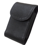
Protective Leather Case